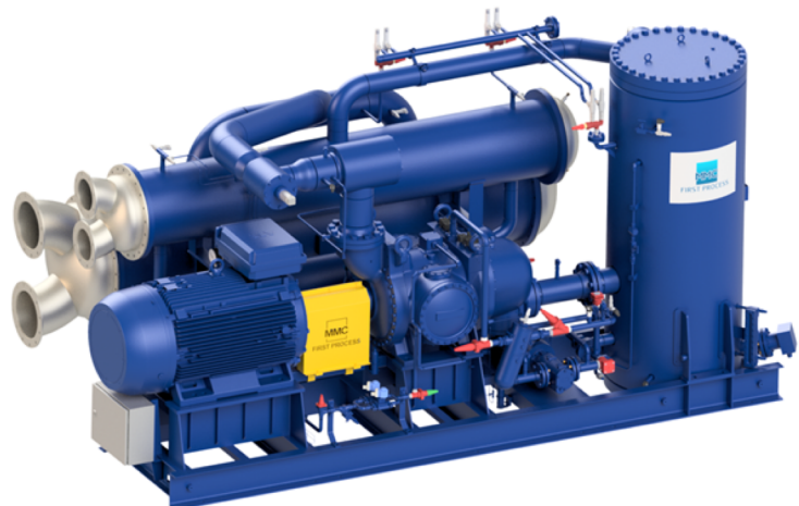
RSW unit with Hall compressor

MMC FIRST PROCESS' compressor units have two options on compressor type, this is Howden and Hall compressors. Each compressor type have different models depending on the capacity.